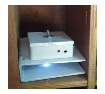
Figure 3. wooden pigeonhole implementation

Figure 3 shows the implementation of the sensor module using a wooden pigeonhole.