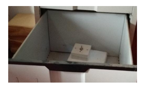
Figure 4. Metal pigeonhole

Figure 4 shows the implementation of the sensor module using metal pigeonhole.